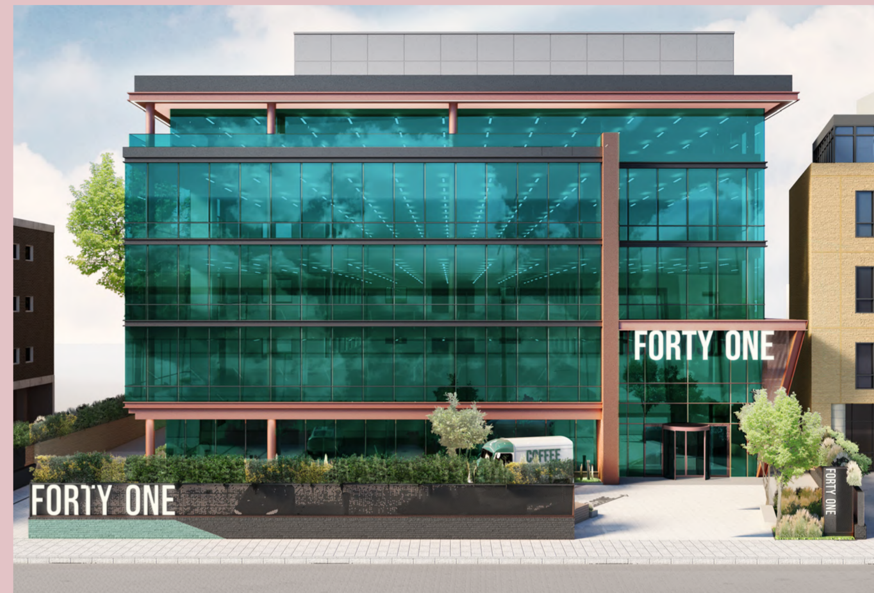
View from Clarendon Road